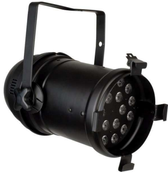
3W LED Par 64